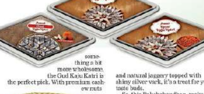
something a bit more wholesome, the Gud Kaju Katri is the perfect pick. With premium cashew nuts and natural loggery topped with shiny silver vark, it's a treat for your taste buds.

Rakshabandhan is all about celebrating the loving connection between brothers and sisters. It's a bond tied with threads of love and sealed with a sweet treat. And when it comes to sweets, very little matches the decadent taste of Amul Kaju Katri. After all, no festival is complete without a bit of indulgence. On this special day, the usual sibling squabbles take a backseat, leaving only the joy of sharing. Sharing love, laughter and, of course, mouth-watering sweets.