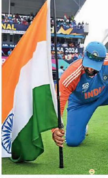
In June, Rohit Sharma led India to victory at the T20 World Cup final. However, that did not make him immune to controversy. While Rohit and co celebrated the victory, a flag was handed to the skipper, who cockily tried to plant the flag in the Barbados ground - inadvertently touching the flag to the ground and attracting the wrath of the toll army.