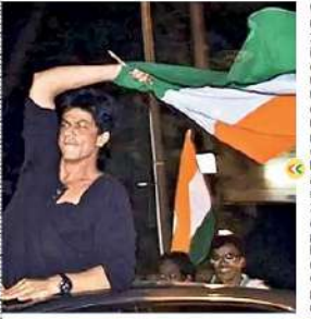
When India won the Cricket World Cup in 2011 and everyone, including Bollywood celebs, spilled out on the streets waving tricolours to celebrate, little did they know that a momentary lapse would mean getting booked by the police a year later. While surfing the net in 2012, a 'social activist' came across photos of SRK holding the tricolour upside down while waving it and promptly filed a complaint.