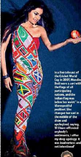
In a live telecast of the Cricket World Cup in 2007, Mandira Bedekar was seen with the flag of all participating nations, and the Indian flag was below her waist, 'in a disrespectful position'. She changed her sari in the middle of the show and apologized saying, 'If I have offended anybody's sentiments, I offer my deep apology. It was inadvertent and not intentional'.