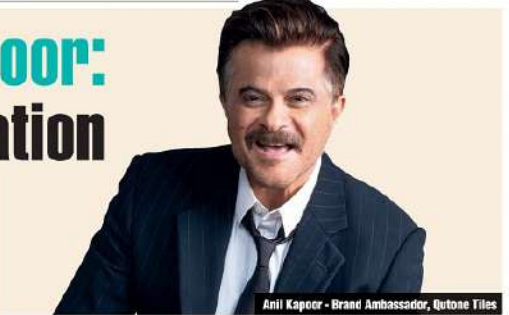
Anil Kapoor - Brand Ambassador, Qutone Tiles