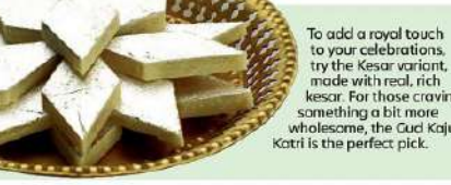
To add a royal touch to your celebrations, try the Kesar variant, made with real, rich Kesar. For those craving something a bit more wholesome, the Gud Kaju Katri is the perfect pick.

When it comes to mithai, it's the quality that sets it apart. Amul Kaju Katri is made with the finest cashew nuts to create pure magic. To add a royal touch to your celebrations, try the Kesar variant, made with real, rich Kesar. For those craving something a bit more wholesome, the Gud Kaju Katri is the perfect pick.