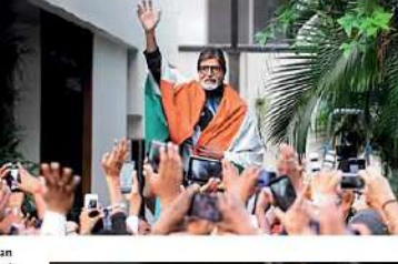
Amir Khan decided to celebrate India's victory over Pakistan in the World Cup in 2015 by waving a tricolour, and even expressed his joy by wrapping himself up in it. 'Such a great joy when you drape the national flag over your shoulders, wrapped around in patriotic fervour... it is the ultimate emotion', he had written on his blog. It took several months for someone to realise they were offended and a case was filed against him and Abhishek for 'covering their bodies with the flag in a manner insulting to the nation'.