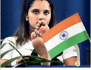
In 2008, Sania Mirza was clicked in Perth, Australia, with her feet up on a table which had a tricolour mounted on it. Whether Sania put her feet near the flag or it was just a camera angle, it blew up into a full-fledged controversy and then a court case that almost made her consider quitting tennis.

While you get caught up in the patriotic fervour, don't make these mistakes with the Indian flag that got celebs in trouble