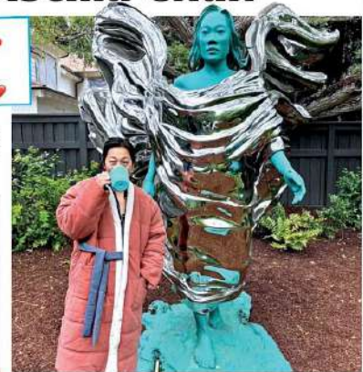
Priscilla Chan with the statue in the photo posted by Mark Zuckerberg. In Roman culture, commissioning a statue of a loved one symbolises admiration.

On Tuesday, Meta CEO Mark Zuckerberg shared on Instagram that he had commissioned a statue of his wife, Priscilla Chan, as a gesture of love, inspired by the ancient Romans. "Bringing back the Roman tradition of making sculptures of your wife," Zuckerberg captioned the post. In the photo, Chan is seen standing next to the statue, which depicts her likeness. The artwork shows Chan in a wind-blown silver garment. In response to Zuckerberg's post, Chan commented, "The more of me the better?" followed by a heart emoji. Zuckerberg's post caused a quite a stir on the platform. "This is the most billionare thing to do ever!" a user replied. "The right woman turns a boy into a real man!" another added. "Wife guy level: Advanced." a user wrote below the post.