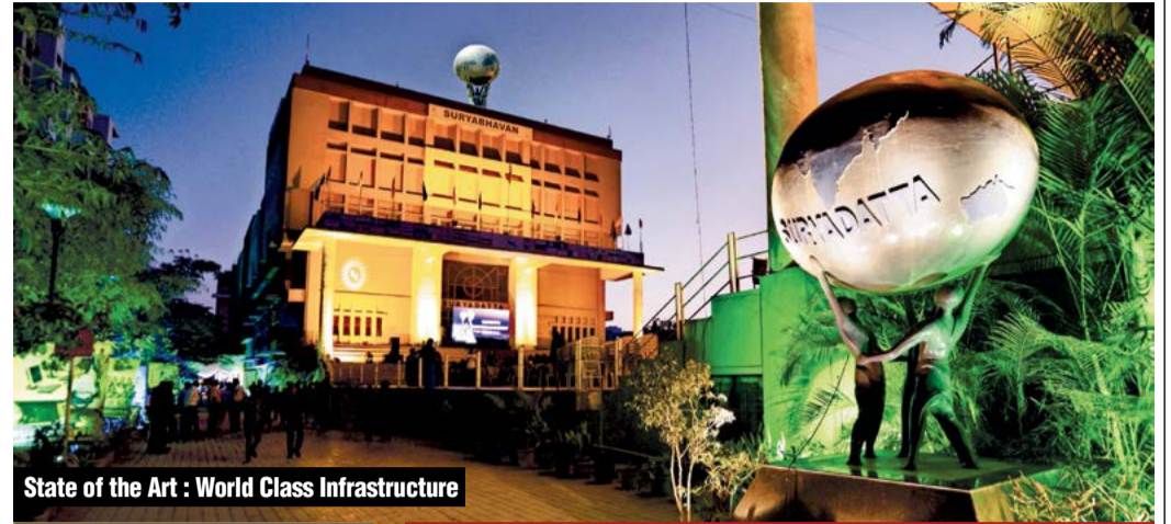
State of the Art : World Class Infrastructure